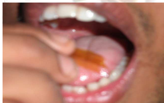
Fig. 1 (A)