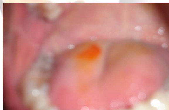
Fig. 1 (C)